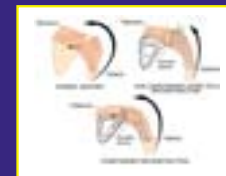
The new "constrained" scapular prosthesis passively recreates the stabilizing function of the rotator cuff.