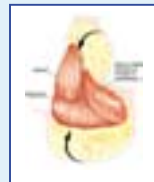
The deltoid and trapezius muscles are tenodesed to each other to recreate the abduction moment