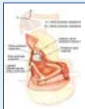
Most high-grade tumors of the scapula are resected via an extra-articular osteotomy of the proximal humerus distal to the rotator cuff insertion and proximal to the deltoid insertion.

Scapular resection is performed using a posterior approach unless there is an anterior tumor component necessitating an anterior incision and exploration of the axillary artery and brachial plexus. The trapezius and deltoid are first divided at their scapular spine and acromion attachments after which the remaining periscapular muscles, including the rhomboids, teres major, minor, serratus anterior and levator scapulae are divided 1 - 2 cm from the scapula. The scapular insertion of the latissimus dorsi is detached.