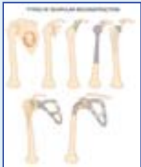
Methods of reconstruction after scapular resection

In this report, the authors compare their experience with suspension of the humeral head from the clavicle after total scapular resection with endoprosthetic scapular reconstruction.