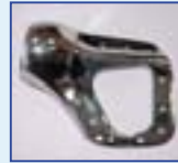
The prosthesis is smaller than a natural scapula to simplify soft-tissue reconstruction and multiply fenestrated to allow for myodesis.