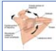
The prosthesis is placed on the serratus anterior and attached to and covered by the rhomboids, trapezius and latissimus dorsi. The latissimus dorsi is mobilized superiorly to cover the inferior 2/3 of the prosthesis and provide protection to the prosthesis from subcutaneous placement.