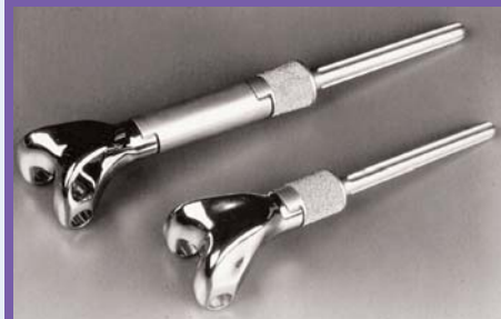
The size of a modular prosthesis can be determined at the time of surgery and allows for maximum flexibility for the surgeon

The concept of limb-sparing surgery, or limb salvage, has gradually evolved over the past 25 years. Prior to this, the basic principles of surgical oncology for the extremities consisted solely of determining the correct level at which to perform an amputation. The senior author (MM) was among the first surgeons to adopt the use of metallic segmental endoprostheses for the routine reconstruction of skeletal defects following sarcoma resections. This review summarizes the short and long term results of endoprosthetic reconstruction at multiple anatomical locations by a single surgical team.