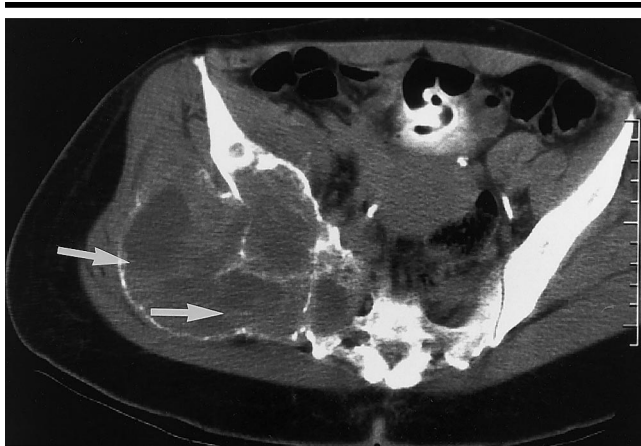
Figure 3. Transverse contrast material-enhanced CT image of the middle of the pelvis obtained in a 45-year-old woman with a newly diagnosed 6-cm renal cell carcinoma and a mass in the right hip shows a cystic tumor. The CT scan shows a large cystic lesion of the right iliac bone, with multiple small hemorrhagic fluid levels (arrows). Initial percutaneous biopsy results showed nonspecific malignant cells. Frozen section analysis results at the time of surgery were also positive for malignancy but not diagnostic of osteosarcoma. Final pathologic evaluation after resection of the gross specimen showed telangiectatic osteosarcoma.

dle inserted through a 12- or 16-gauge needle, with final cores being obtained with the larger needle size, was frequently used in this group.