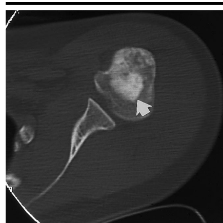
Figure 1. Transverse CT image of the left shoulder obtained in a 16-year-old adolescent girl shows a small sclerotic osteosarcoma (arrow) of the proximal humerus. Note that attenuation of the lesion is equal to or greater than that of the adjacent bone cortex. Osteosarcoma was proved with biopsy results and was surgically resected.

There were 26 patients with a sclerotic tumor. A sclerotic lesion was defined as a lesion in which greater than 50% of its internal composition was equal to the